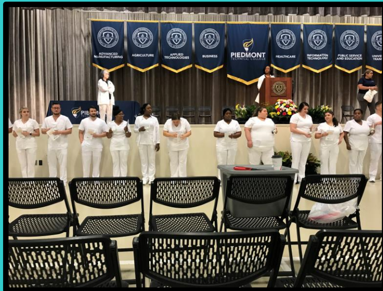
Pinning Practice - PTC ADN Graduates Reciting Nursing Creed