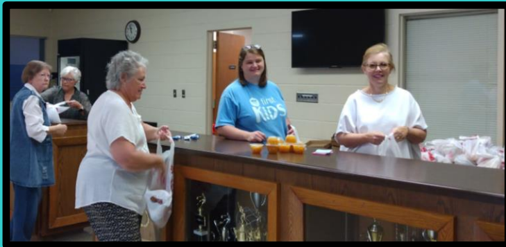
Woman's Missionary Union, FBC, Gadsden AL

♥ 25 Goody Bags for Respiratory Therapy Students