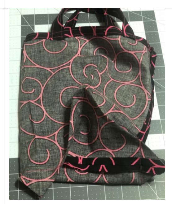
Image 19 Both corners are sewn and bag is ready to turn right side out.